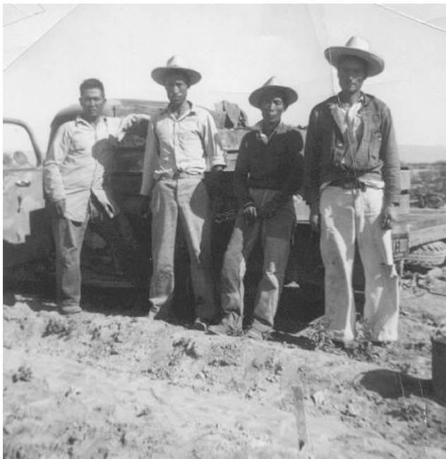
Filipino Agricultural Workers in New Mexico