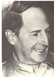
Gen. Douglas MacArthur